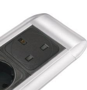
The NETBOX Line has a sleek and contemporary aesthetic.

The NETBOX Line is customizable in various lengths and can be connected using a starter or connector cable. One special option is having such cables for the power supply hard wired to the unit. The NETBOX Line can also be paired with a monitor arm, which is secured by a metal bracket.