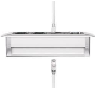
The NETBOX Line works on the Plug-and-Play concept when configured with a coupler.