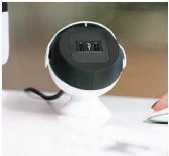
The NETBOX Pearl can be configured to include a USB charger.

boasts a lid that slides open easily to reveal power, data or multimedia outlets as well as a USB charger and stays close to keep dust out. The NETBOX Pearl is available in seven sleek colors, and comes with a hardwired starter cable or connector cable of any length.