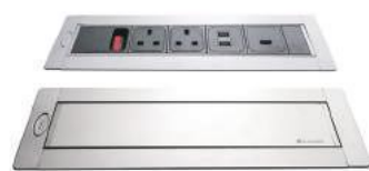
The NETBOX Turn Comfort shown in open and closed positions.

Both NETBOX Turn and Turn Comfort permit access from any angle, rendering them highly flexible solutions. As the cables run underneath the table, its sleek appearance is further enhanced, especially in table tops with a minimum thickness of 10 mm. The NETBOX Turn and Turn Comfort are available in customizable lengths.