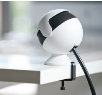
Desk-mounted with powerstrips or clamp and a lid slides open to reveal the module or stays closed to keep dust at bay.