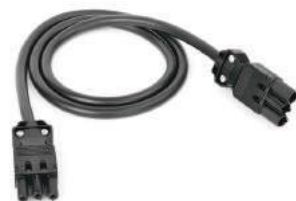
Connector cables are available in customized length to create daisy-chain power transmission.