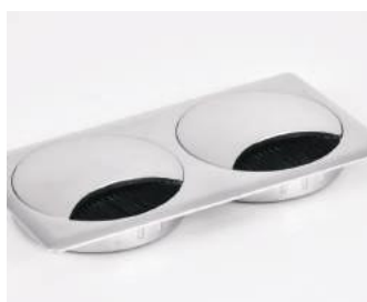
The wireless charging module or NETBOX Point can be mounted by means of twin grommets in matte silver.