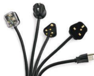
A. & H. Meyer provides an extensive portfolio of starter cables that meets international safety and quality guidelines.