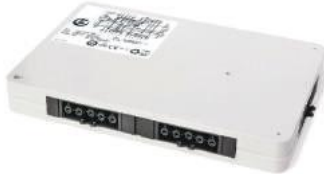
The grey box allows a larger distribution of power into your system.