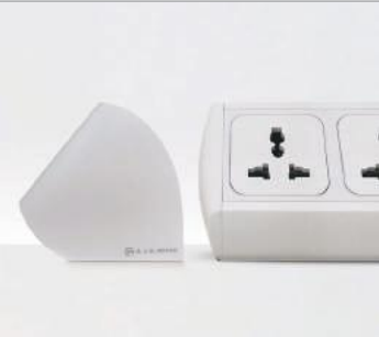
Featuring fluid lines and curves, this modular unit boasts leaf-inspired end-caps.