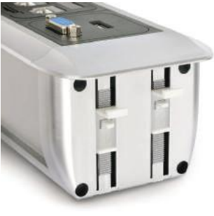
The unique click-stop mechanism makes installation quick and tool-free.