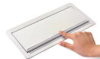
The unit's unique spring mechanism allows for easy access at the push of a finger.