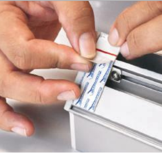
Opt for a tool-free installation with a loaded Powerstrip or mounting with a clamp.