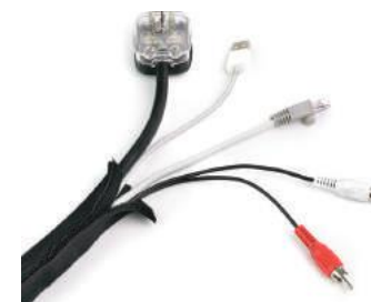
Cables can be neatly corralled in a cable sock, thanks to Velcro fasteners.