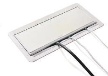
The NETBOX Axial Comfort can be utilized even in a 'closed' position, thanks to the rubber lips which allow cables to enter and exit.