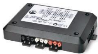
The black box is designed to distribute power into your system.

The connectors can be color-coded to facilitate easy and prompt installation while the Plug-and-Play technology provides time-saving benefits if you have to relocate or change the configuration of your installation. Used predominantly with power and lighting circuits, the various specifications of the NETSYSTEM provide flexibility and safety to meet virtually any application requirement: workstations, raised floors, suspended ceilings, small distributors, interior work, as well as container offices.