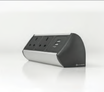
The facia of the NETBOX Leaf is offered in either black or signal white color.

This unit can be configured with 250 modules to meet any requirements and comes hardwired with a built-in starter or connector cable of customizable length. Emblematic of an organic modern aesthetic, the NETBOX Leaf features fluid lines and dynamic curves with end-caps that mimic the shape of a leaf. Choose from a facia color of either black or signal white.