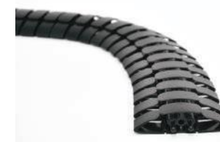
The Cable Snake Pro is designed to lie flat on the floor while other cable snakes come in a hanging position.