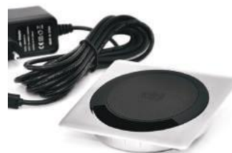
The wireless charging module features an 80mm cable grommet.