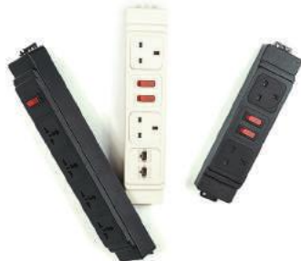
The NETBOX M is available in 2-, 3-, 4- or 5-gang configurations and in different colors.

plastic sheath, NETBOX M can be installed and used in many settings, and can be mounted to any surface or concealed within partitions and cable trays.