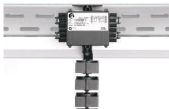
The light terminal box VR is ideal for cabling in a lighting system or workstation.