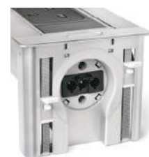
The unique click-stop mechanism secures the unit safely into position – making installation quick and tool-free!