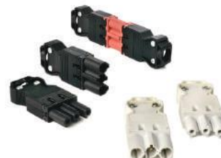
A. & H. Meyer also offers a choice of male and female connectors in various colours.