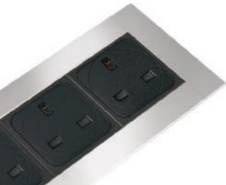
The NETBOX Style features a clean and angled design.

The large number of possible combinations allows for individual and specialized solutions. The tool-free mounting via click-stop device guarantees a smooth fitting and time savings. The NETBOX Style can be connected using a starter or connector cable in different lengths.