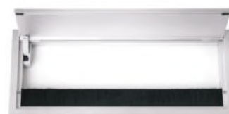
The aluminium flip-up cover is offered separately to suit your storage needs.