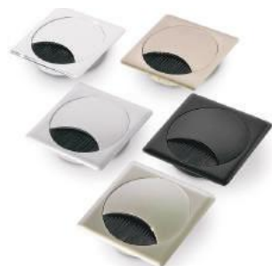
Square cable grommets are available in five stylish finishes