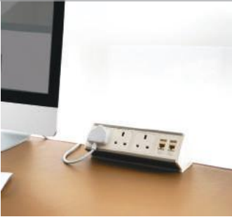
The unit sits flush with the edge of the table due to its elegant design.