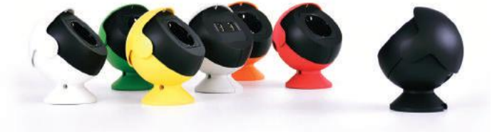
In addition to black and white, the NETBOX Pearl is available in five standout colors.