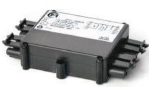
The light terminal box VR comes in various options that make for a neat and tidy installation.