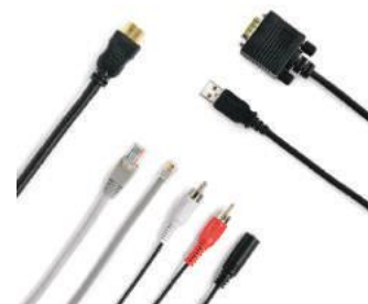
Select from A. & H. Meyer's line-up of data cables for your data solution.