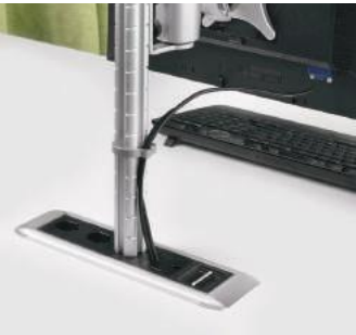
The NETBOX Line can be matched with a monitor arm.