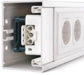
The NETBOX M is shown inserted into a trunking system.