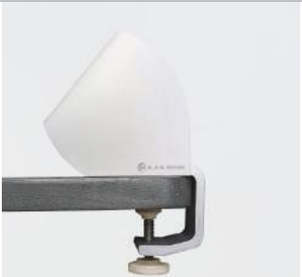
Installed tool-free, the NETBOX Leaf is securely mounted to the tabletop by means of Powerstrips or a clamp.