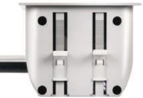
The click-stop mechanism allows for speedy installation.