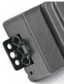
The side brackets enable the NETBOX M to be mounted to surfaces or embedded in partitions.