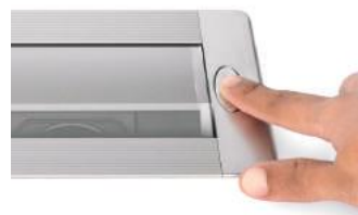
The NETBOX Turn Comfort rotates, at a touch of a button, to expose or conceal the outlets.