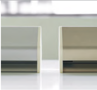
The profile of the NETBOX Smart is available in silver or champagne color.

A modular desktop unit, the NETBOX Smart is specifically designed to optimize workplace efficiency by facilitating desk-sharing setups. Easily mounted with Powerstrips, this flexible electrification solution provides direct access to power and communication connections. The NETBOX Smart can be fitted as per your requirements with a choice of 250 modules, and comes with a built-in connector cable. Clean-lined and classic in silhouette, its profile is available in silver or champagne color with black or white facia.