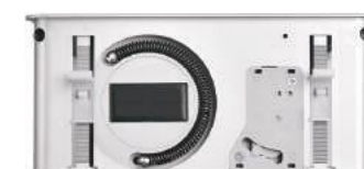
The click-stop mechanism renders installation speedy and effortless.

As the rubber lips allow cables to travel to and from desktop devices such as computers, telephones and multimedia equipment, the units remain close even when in use. The outlets are positioned below the table surface and work best with tabletops with a minimum thickness of 10 mm. Self-contained and simple to install, both units are available in customizable lengths and can accommodate the entire portfolio of A. & H. Meyer's outlets.